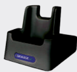
■ 94ACC0208 Single Slot Dock Charge only