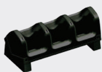
■ 94ACC0206 3-Slot Dock